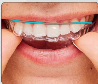
ClearCorrect design High and flat

Our unique design is proven to help your doctor have more control over how your teeth move during treatment 4 , helping you both achieve your goals.