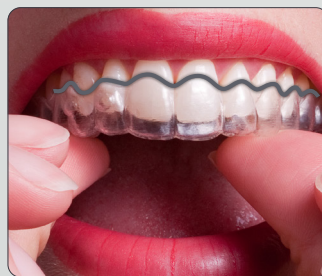
Competitor's design Scalloped